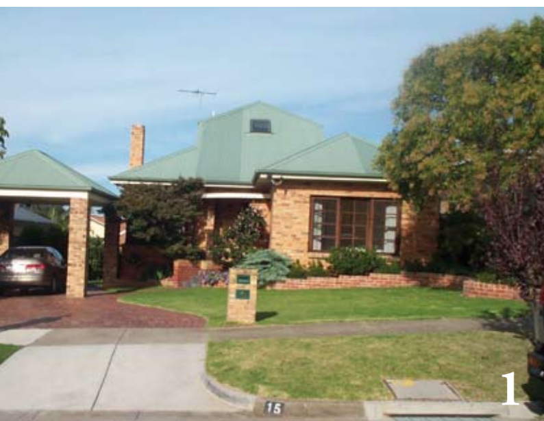
1. Before work commenced 2. Upstairs master bedroom 3. Skylights over stairwell 4. Open living and dining areas with feature wall 5. Master bedroom ensuite 6. After, street frontage 7. 3D model of proposed extension provided by HHE